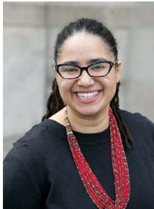
Award of Excellence—Social Media Single Posting